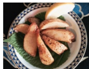
9 Thick-cut French Fries