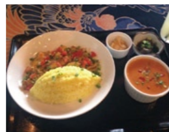
16 Pink Curry