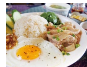
21 Singapore Chicken Rice