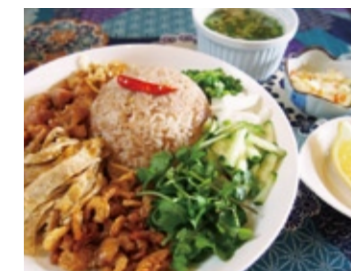
19 Khao Khluk Kapi