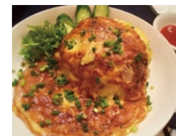
18 Naem Omelet with Jasmine Rice