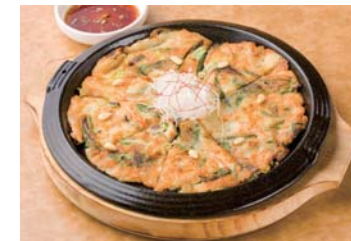
21 Seafood Korean-Style Pancake