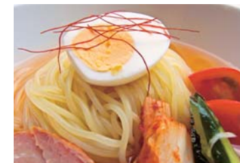
24 Korean-Style Cold Noodles