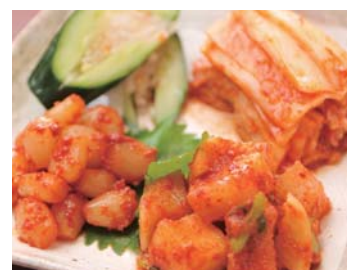
20 Kimchi Assortment