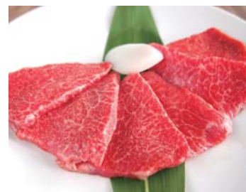
3 Short Loin