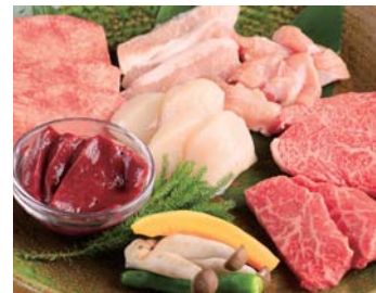
1 Assortment of 7 Popular Dishes