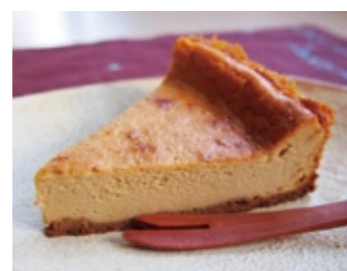
4 Brown Sugar Cheesecake