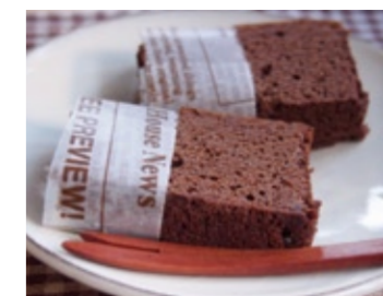
6 Bitter Chocolate Pound Cake