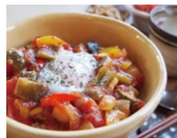
2 Bowl of Rice Topped with Caponata and a Poached Egg