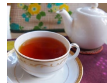
7 Darjeeling Tea