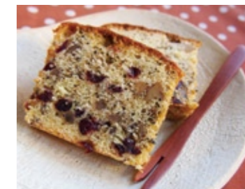
5 Tea and Cranberry Pound Cake